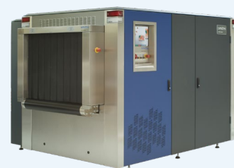
HI-SCAN 10080 EDX-2is