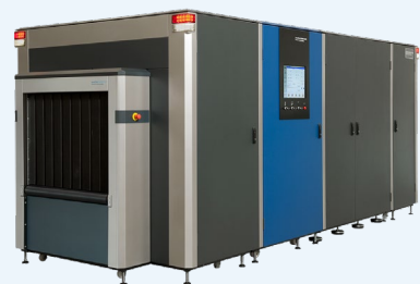
HI-SCAN 10080 XCT