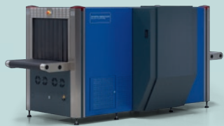
HI-SCAN 7555aTiX Multi-view system designed for liquids detection in carry-on baggage and checked baggage screening according to EU EDS Std. 2