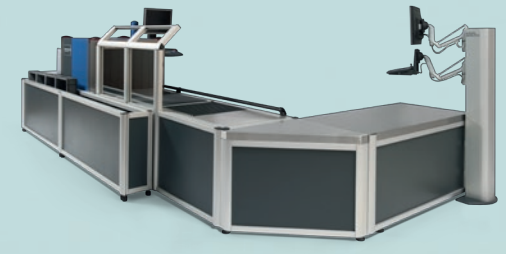
iLane.pro Modular tray return system for customised checkpoints