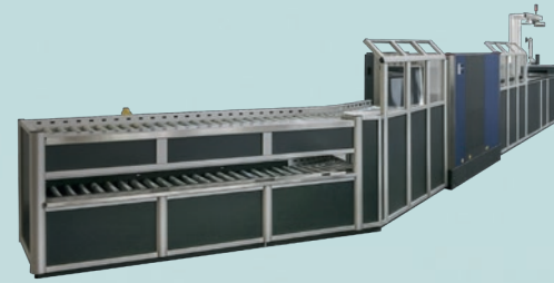
iLane.evo Advanced checkpoint conveyor system with a high degree of automation