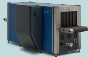
HI-SCAN 6040aTiX Multi-view X-ray system for automatic detection of solid and liquid explosives in carry-on baggage EU LEDES Std. 2 Type C approved