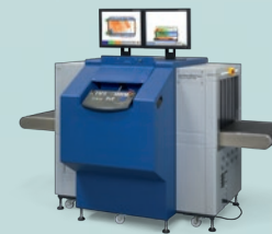
HI-SCAN 6040-2is HR Dual-view X-ray system for the automatic detection of explosives in carry-on baggage EU LEDES Std. 3 Type C approved