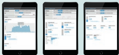
Checkpoint.Evo plus Checkpoint management software for networking, analysis and reporting Enables remote screening and directed search