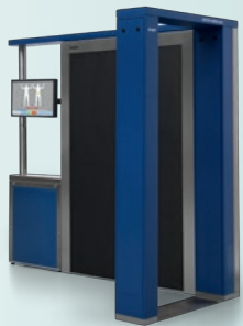
eqo Open plan people screening system based on millimetre wave technology EU Std. 2 approved