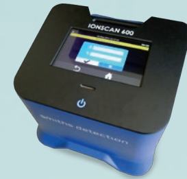
IONSCAN 600 Desktop ETD system detects traces of explosives and narcotics

Smiths Detection offers everything from standard, off the shelf products to complete, individually tailored solutions. We have all the proven expertise, experience and back-up you need – and all from one source. Put your trust in us for high quality equipment, reliability and a global service footprint.