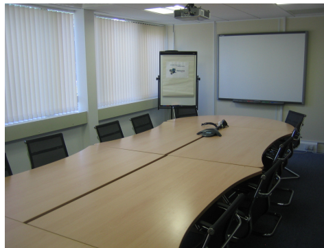
Smiths Detection Training Centre (Our new Training Centre will open by the end of 2011)