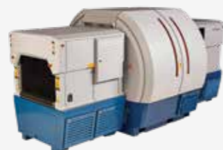
CTX 9800 DSi

COMPLIANCE ECAC EDS Std. 3 & 3.1 approved TSA certified [5.8 & 7.2] TSA qualified CAAC certified IPMO certified