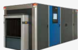
HI-SCAN 10080 XCT

COMPLIANCE ECAC EDS Std. 3 & 3.1 approved TSA certified [5.8 & 7.2] STP image quality