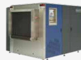
HI-SCAN 10080 EDX-2is

COMPLIANCE ECAC EDS Std. 2 approved Regulation [EU] 2015/1998 compliant in 100% inspection mode