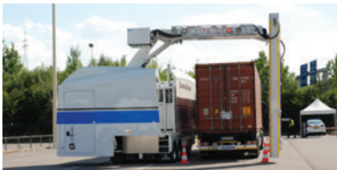
HCVM T performing a random truck inspection

through colour, the feature could identify and pinpoint abnormalities within vehicle contents. Automatic Threat / Target Recognition (ATR) software was also incorporated in the system to benefit operators by highlighting specific areas where particular threats or targets are located. Combined, these features increased operator efficiency and reduced the need for manual inspections.